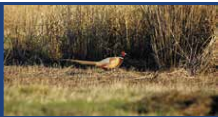
A pheasant calls this CREP area his home.

As you decide whether CREP enrollment fits your business plan, you'll be working with the USDA Farm Service Agency (FSA) and Natural Resources Conservation Service (NRCS), and the Kansas Department of Agriculture (KDA).