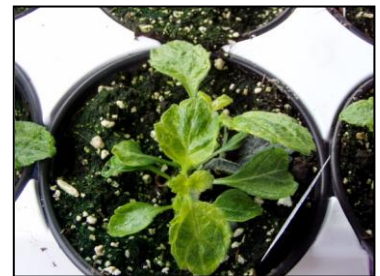
A POTY virus infection of Lantana from a cutting source. Symptoms include distorted growth, mosaic, and stunting.

Viruses: Several viral diseases can get into greenhouse production sites and infected plants can exhibit necrotic line patterns or ring spots, mosaics, tissue distortion or malformation, color breaking and/or stunting. Symptoms are not always present or can fade out even though the virus is present making sanitation extremely important.