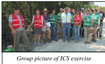
Group picture of ICS exercise

for a nursery pest that was managed using the Incident Command System (ICS).