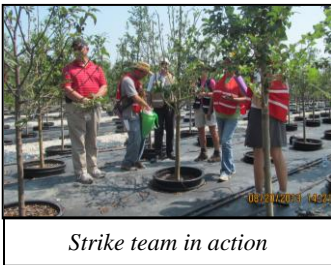
Strike team in action

The Plant Protection Program and the Central Chapter of the Horticulture Inspection Society (HIS) hosted a multi-state inspector training in Ottawa, Kansas on August 19-21.