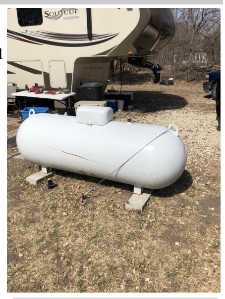
Improperly anchored propane tank