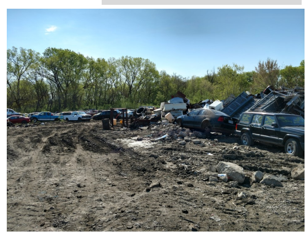
Unanchored vehicles stored in the floodplain