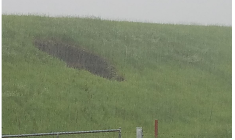
Above: Heavy rain caused a sinkhole to form in a significant-hazard dam near Sabetha, KS in May 2019.

One way that you can help boost flood insurance coverage in your community is by targeting your outreach to specific interest groups. For instance, property owners who live downstream of dams should consider purchasing flood insurance. This is especially vital for those located in the mapped breach inundation area of such dams. The level of hazard from dams in Kansas is classified not by dam condition, but by projected consequences from a dam failure. "High-hazard" dams are those that could cause extensive injuries or property damage in the event of a failure. "Significant-hazard" dams can also cause injuries and damage homes and property. Owners of these classes of dams are required to develop maps of the area that would be flooded by a breach. Property owners can view these