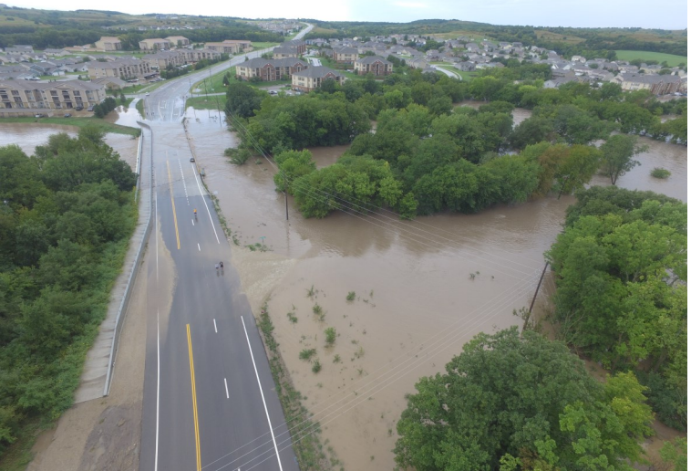
Above: Water approaches apartment homes in Manhattan during the Labor Day 2018 flood event.

Even renters of properties not located in a Special Flood Hazard Area can protect their possessions with a preferred-risk policy. More information is available in FEMA's <u>PRP brochure</u>. To purchase flood insurance, contact your local insurance agent. An engaging way to learn more is available through the National Association of Insurance Commissioners' "What the Flood!" site.