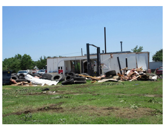
Above: This repair shop in Eureka suffered tornado damage in 2018.