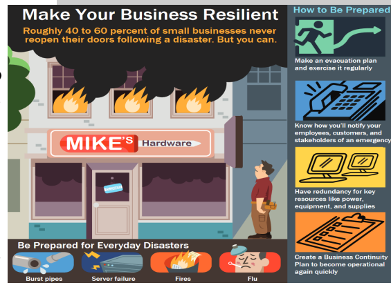
Above: It is important for business owners—and local governments—to be prepared for unexpected events.