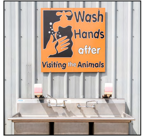
A handwash station with appropriate signage for visitors.