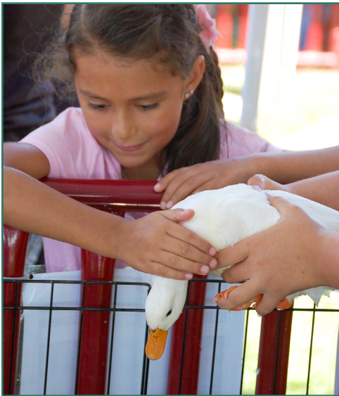
Girl petting a duck.

Agritourism can provide exciting attractions, public education, and added income to farms and ranches. Animals can be a fun part of the tour. Keeping your animals and visitors healthy can happen with some simple biosecurity actions.