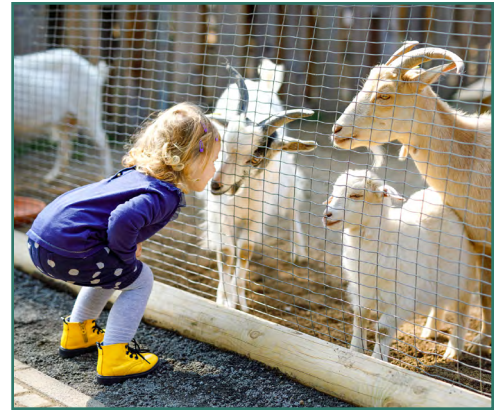
Girl interacting with goats behind a fence.